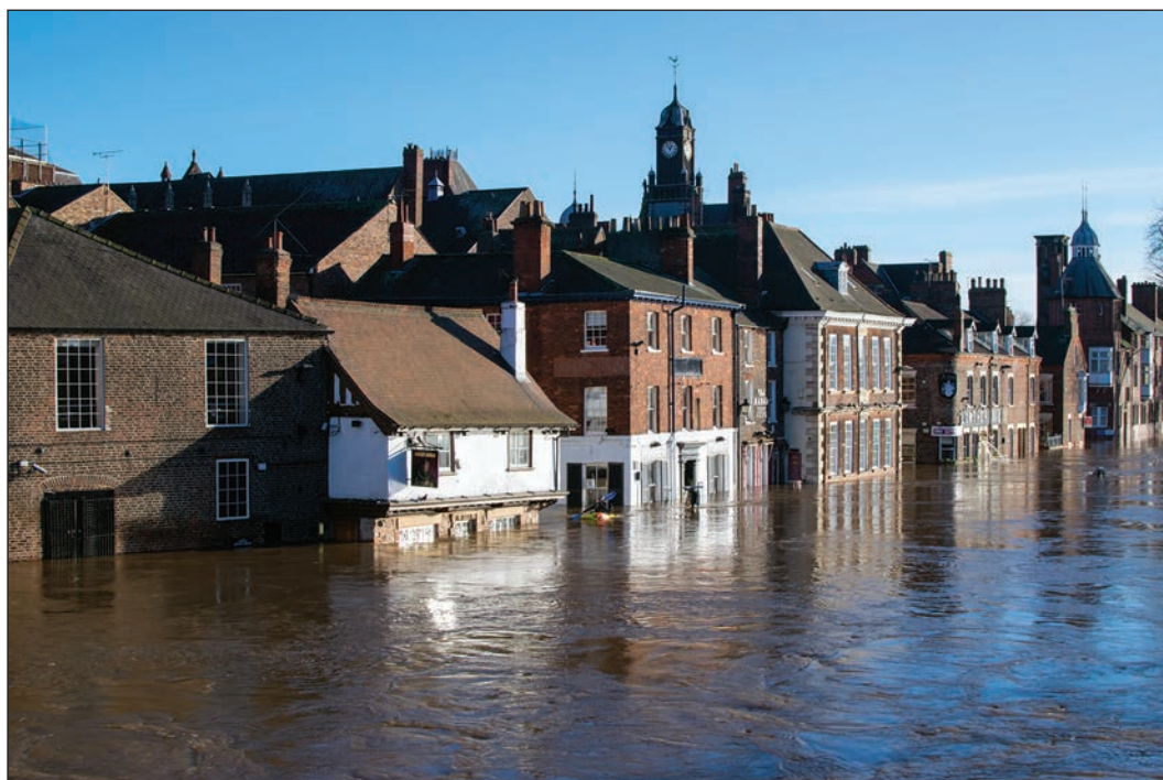
Photograph 2.1 – Flood event 2015

Tick (✓) two enquiry questions that could be chosen to investigate the sustainability of flood defences in this area. [2]