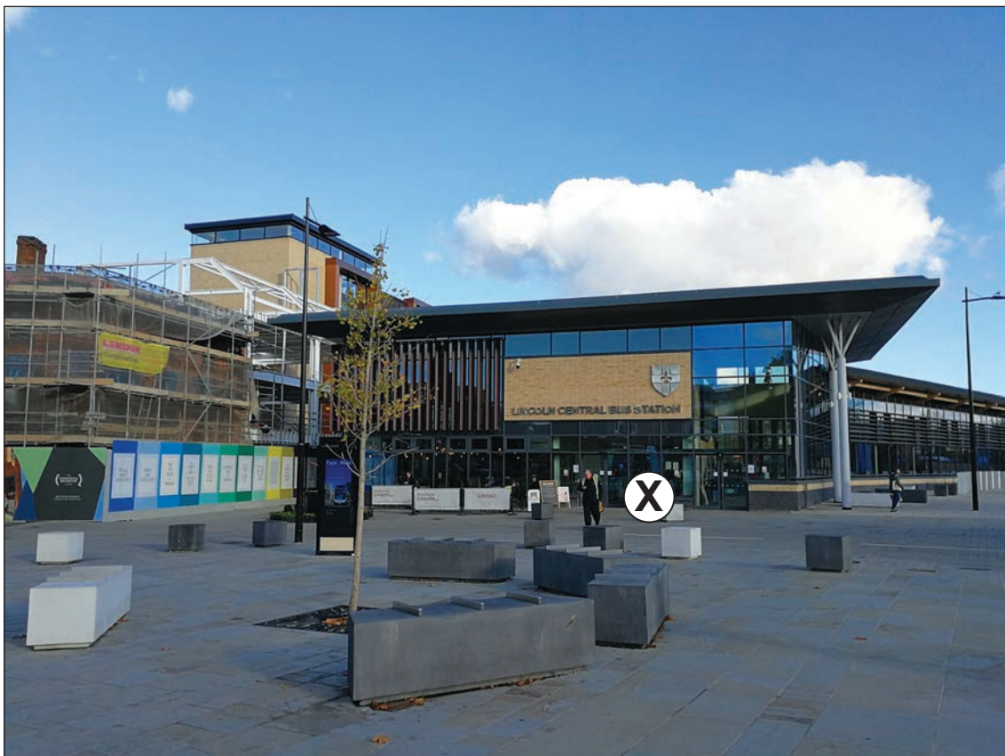
Photograph 1.1 – Brownfield development in a city centre